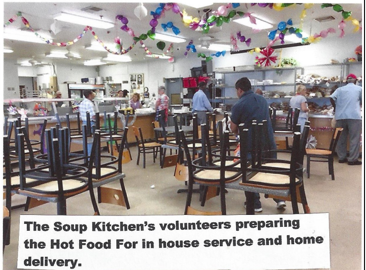
The Soup Kitchen's volunteers preparing the Hot Food For in house service and home delivery.

Your Brother Dokey's hard at work for the Soup Kitchen in Florida